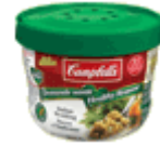
Campbell 's® Healthy Request® Bowls – 420 mL