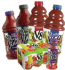
V8® vegetable cocktail 156 mL, 250 mL, 340 mL, 354 mL, 950 mL, 1.36 L, 1.89 L cans SAVE: crushed cans bottles SAVE: labels boxes SAVE: UPC