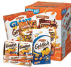
GOLDFISH® crackers 28 g, 168 g, 180 g, 190 g, 200 g, 1.36 kg SAVE: UPC